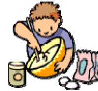
Learn, cook, grow