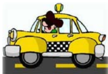
Movin' & consumin'