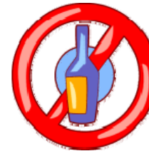
Butt out the binge